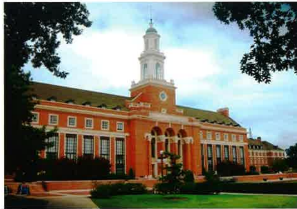
Oklahoma State University