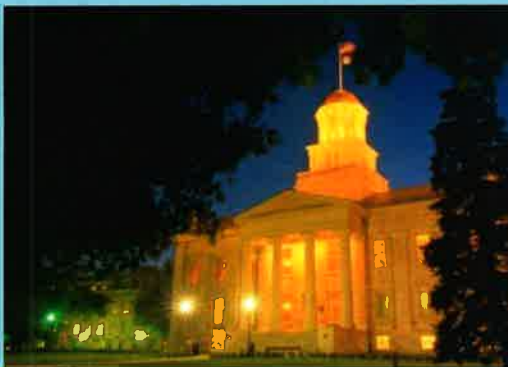
University of Iowa

Historically, about 40% of eligible applicants are awarded scholarships. The highest award percentage by far of any national scholarship.