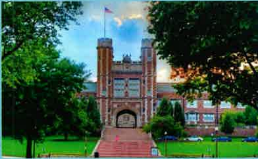
Washington University in St. Louis