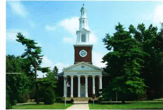
University of Kentucky