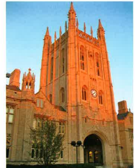
University of Missouri-Columbia

Hagan Scholars from 42 states will attend 325 colleges and universities the fall semester of 2019.